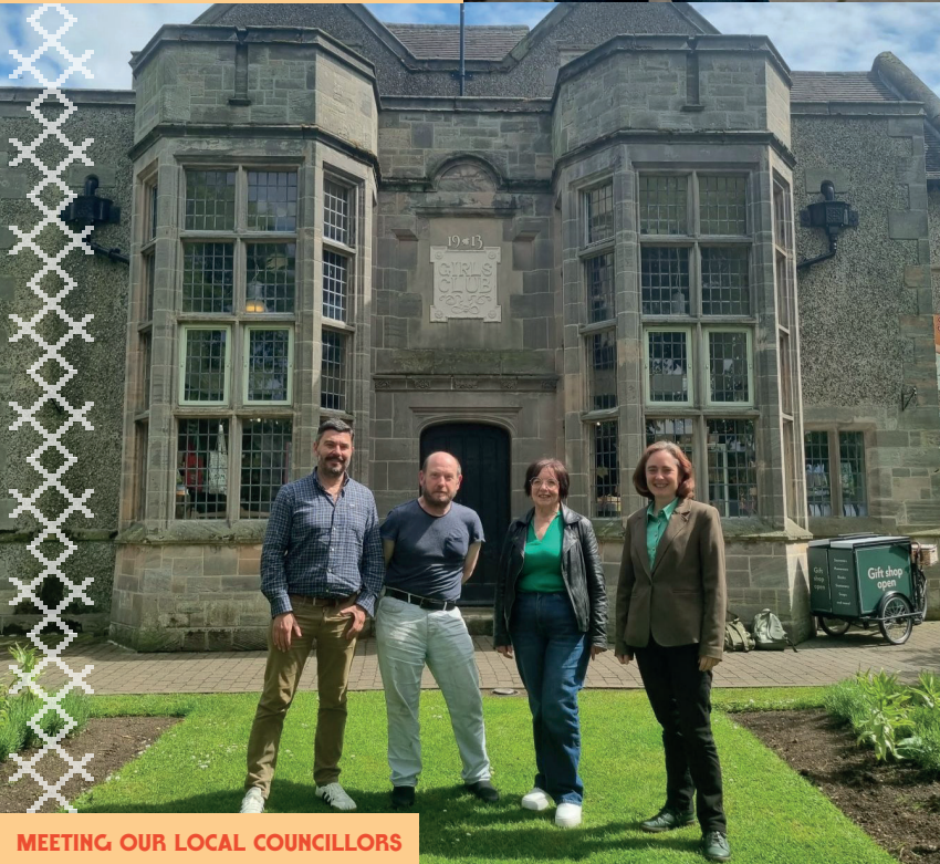
MEETING OUR LOCAL COUNCILLORS