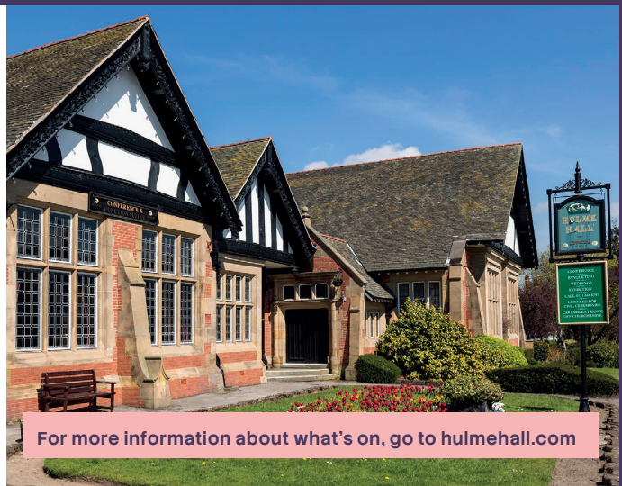
For more information about what's on, go to hulmehall.com

You can also visit Hulme Hall's café for lunches or a coffee and cake, open daily.