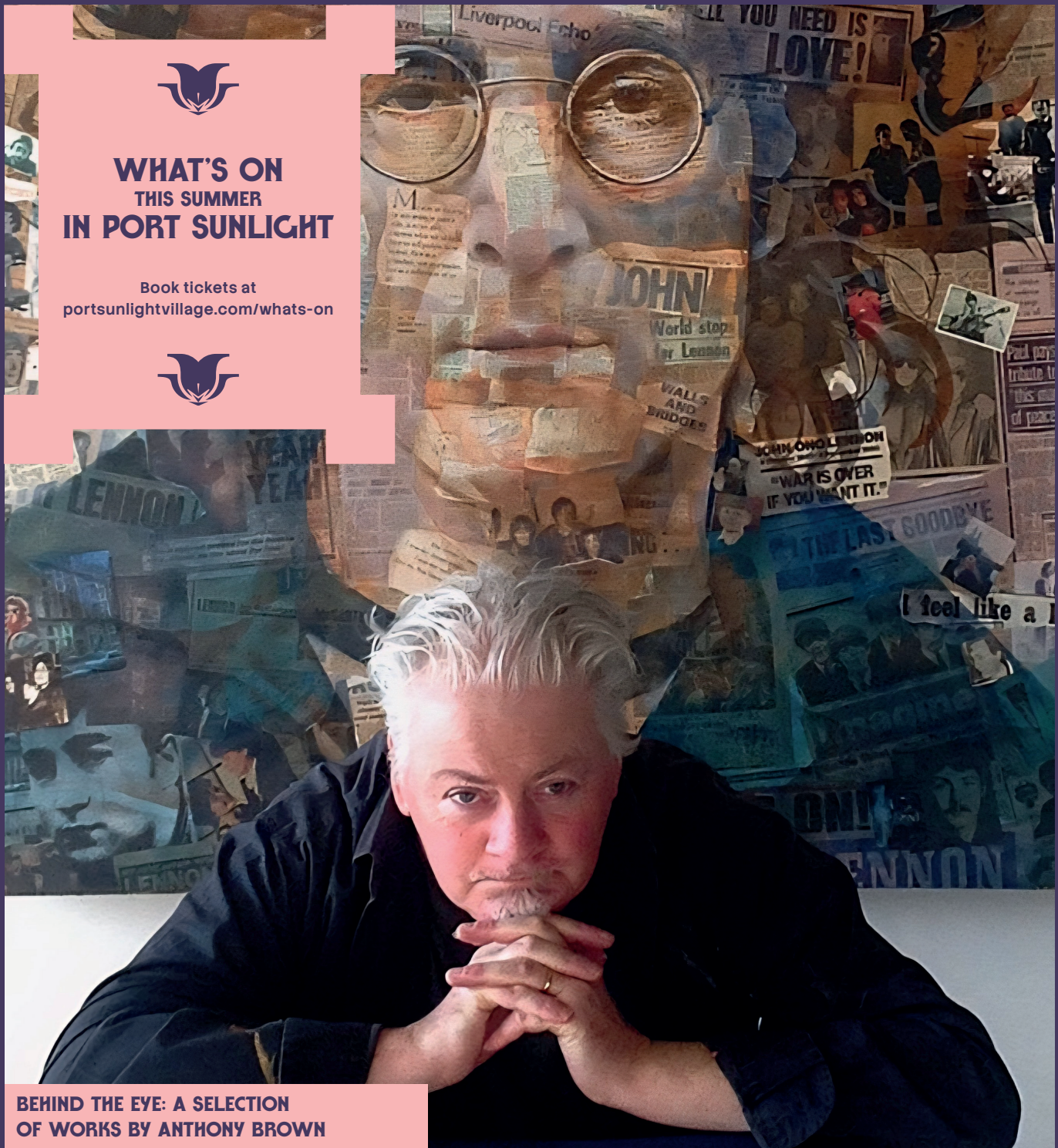
BEHIND THE EYE: A SELECTION OF WORKS BY ANTHONY BROWN

Book tickets at portsunlightvillage.com/whats-on