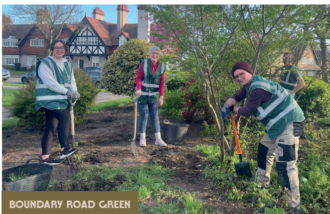
BOUNDARY ROAD GREEN

If you would like to get involved in any capacity, please email l.english@portsunlightvillage.com