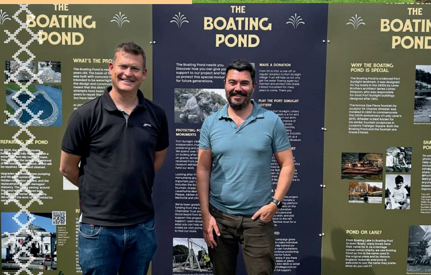
SHOWING JUSTIN MADDERS MP OUR WORK ON THE BOATING POND