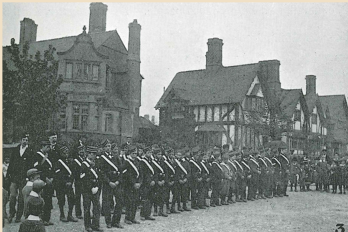
Boys Brigade's First Parade on Bridge Street 6 May 1900

Located adjacent to Port Sunlight's iconic Lyceum as part of the original village school, the Boys' Brigade Building has been an important place for the community, most significantly as a home for the Boys' Brigade and the Lyceum Brass Band. It now provides an opportunity for a range of commercial uses.