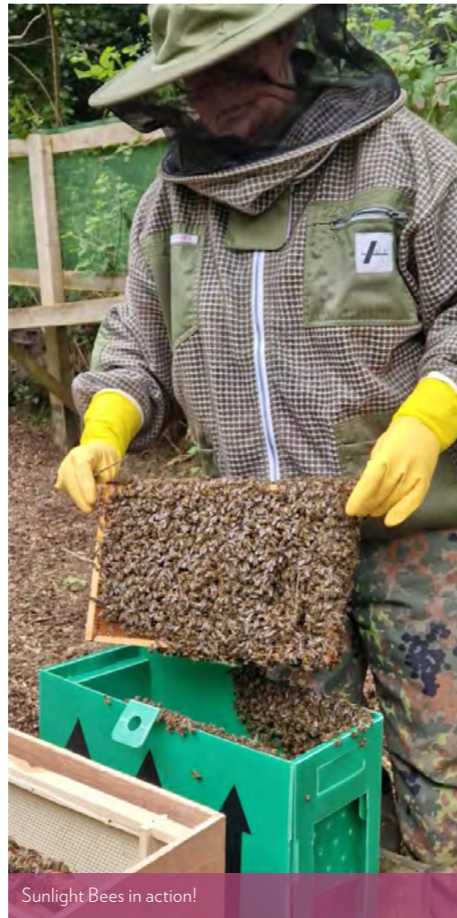
Sunlight Bees in action!

If you would like to be featured in the next issue or know someone who might, we'd love to hear from you. Please email admin@portsunlightvillage.com